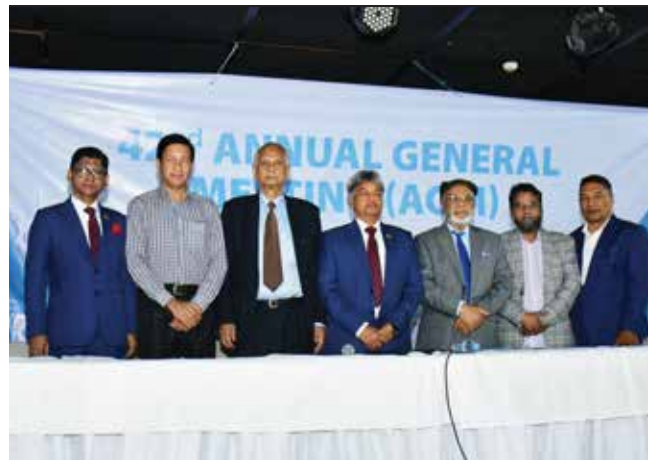
Chairman of Election Board announcing the name of the Board of Directors elected for the year 2024 and 2025 (left) and Group photo of Election Board and Election Appellate Board with Office-Bearers 2022 & 2023 (right)