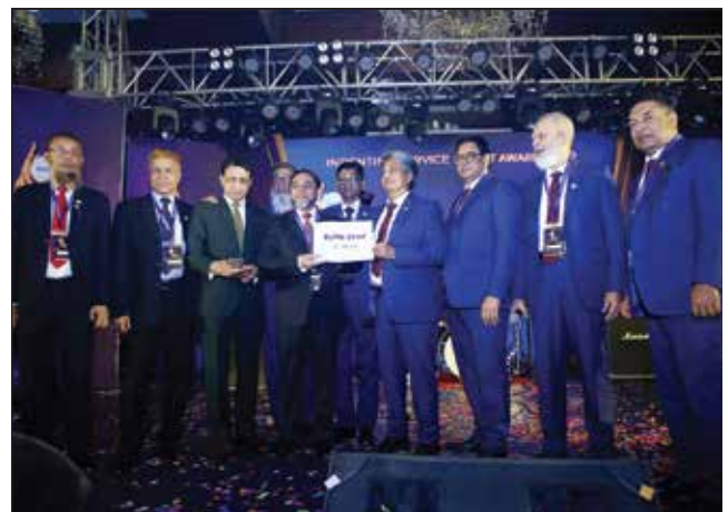
"Members Night" of BIAA held at Pan Pacific Sonargaon on January 27, 2024