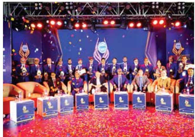
Group Photo of the Awardees of the "Indenting Service Export Award-2022".